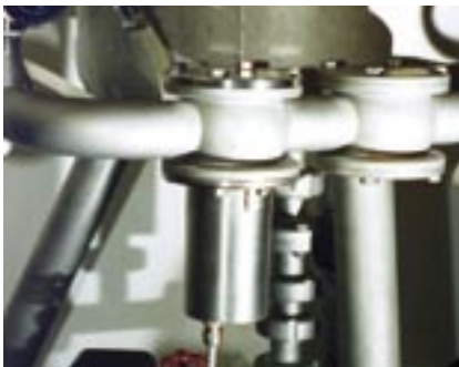
UIP50 for the cleaning of sensors

The ultrasonic processor UIP50 with a power of 50 watts and a frequency of 30kHz as well as the UIP250 with 250 watts and 24kHz are alternatives to the laboratory devices with similar power. They are used for hostile operation conditions. The robust aluminium housing of the transducer with its degree of protection (IP54) withstands dust, dirt, higher temperatures and humidity. The generator, supplied in a housing or as plug-in module for a cabinet, can be located outside the hazard zone.