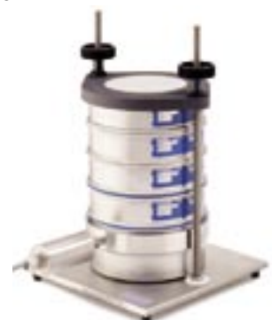
UIS250L at lab sieve tower