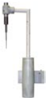
UIP50 as OEM-component