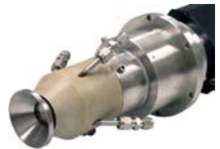
UIP1000 with sonotrode for nebulizing