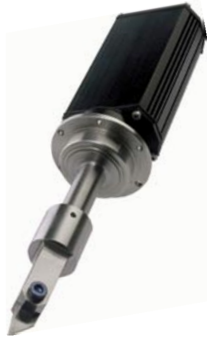
UIC400 with short blade

Exchangeable blades, which are selected to the cutting criteria of the respective application case such as the material, shape and length, are used as tools. The ultrasonic processors can also be constructed for the use in the food industry.