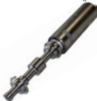
UIP2000 and sonotrode with flange

Despite the enormous power of the ultrasonic processor UIP2000 (2000 watts, 20kHz), the device does not need any additional cooling by water or compressed air. The device works continuously in air. The robust design of the transducer, made of stainless steel and titanium, enables use under extreme conditions of dust, dirt, higher temperatures and humidity. The transducer and in special cases also the generator can be designed as ex-proof versions. According to the