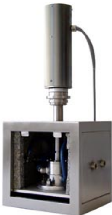
UIP2000 with flow cell/sound protection

Despite the enormous power of the ultrasonic processor UIP2000 (2000 watts, 20kHz), the device does not need any additional cooling by water or compressed air. The device works continuously in air. The robust design of the transducer, made of stainless steel and titanium, enables use under extreme conditions of dust, dirt, higher temperatures and humidity. The transducer and in special cases also the generator can be designed as ex-proof versions. According to the