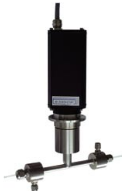
UIP250 with mini flow cell

The oscillating-free flange of the transducer permits positioning accurately in machines or robot arms. For the sonication of liquids at higher temperatures of up to 300°C and pressures of up to 300 atm we offer longer sonotrodes with pressure-tight flange connections.