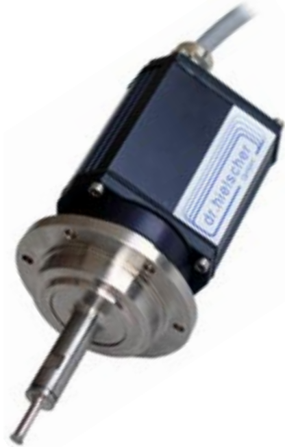
UIP25 with sonotrode for nebulizing