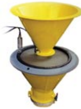
industrial ultrasonic sieving