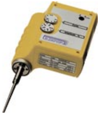
ultrasonic laboratory processors