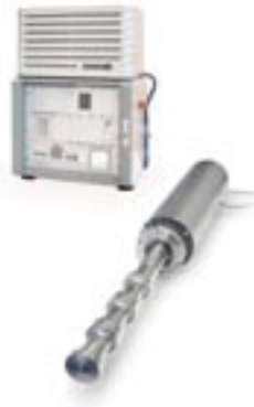
ultrasonic industry processors