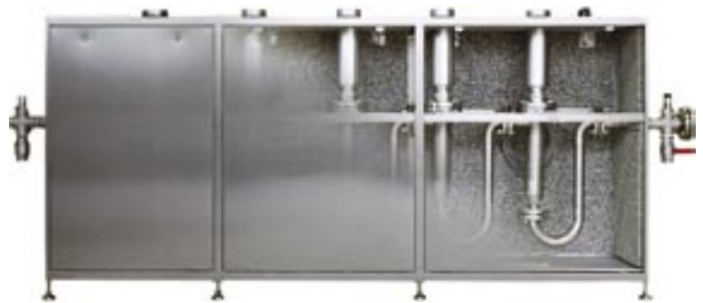
10kW ultrasonic flow system/sound protection (5 x UIP2000)